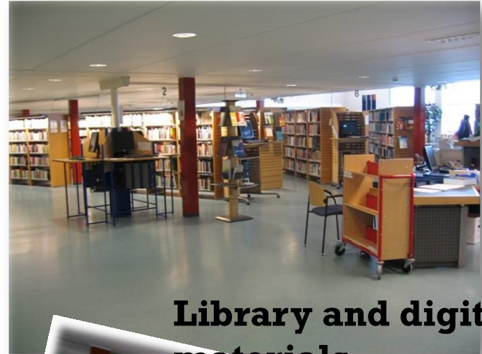
Library and digital materials