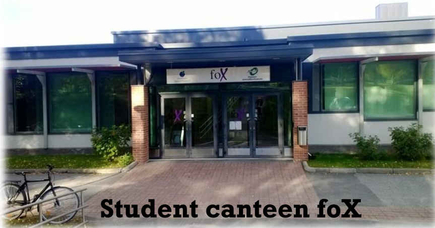
Student canteen foX (2.60 eur per meal)